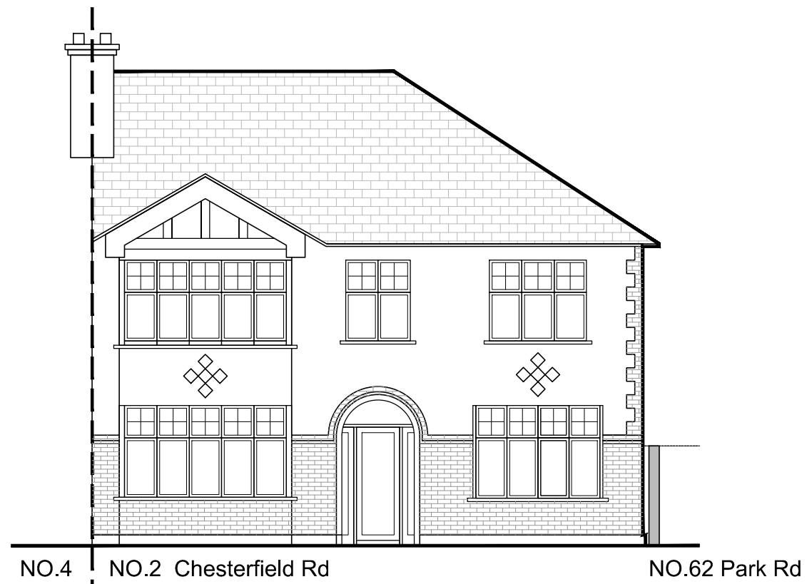
Existing Front Elevation 1:100@ A3

All dimensions are approximate and subject to review. The information is for the evaluation of feasibility only. The drawings may be updated as necessary as more detailed information becomes available.