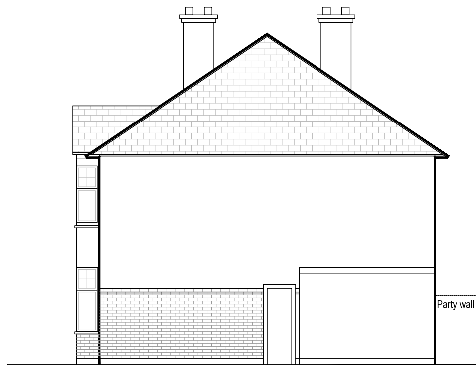
Existing East Elevation 1:100@ A3

All dimensions are approximate and subject to review. The information is for the evaluation of feasibility only. The drawings may be updated as necessary as more detailed information becomes available.